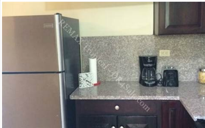
Granite Counter Tops