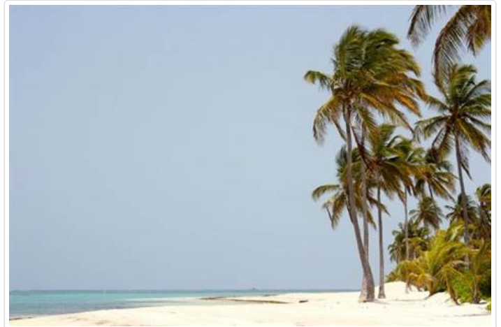
Punta Cana Beach