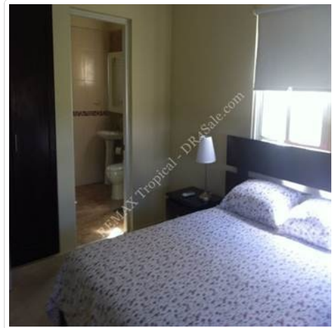
Romo No 2