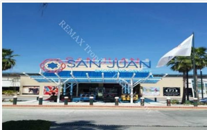
San Juan Plaza