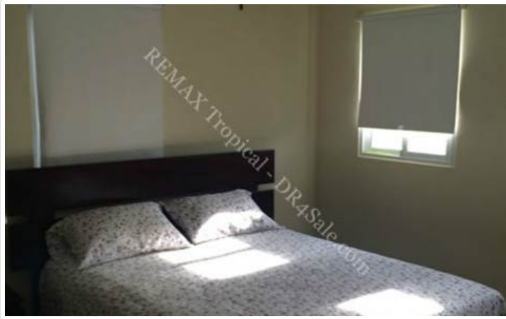
Bedroom no 2