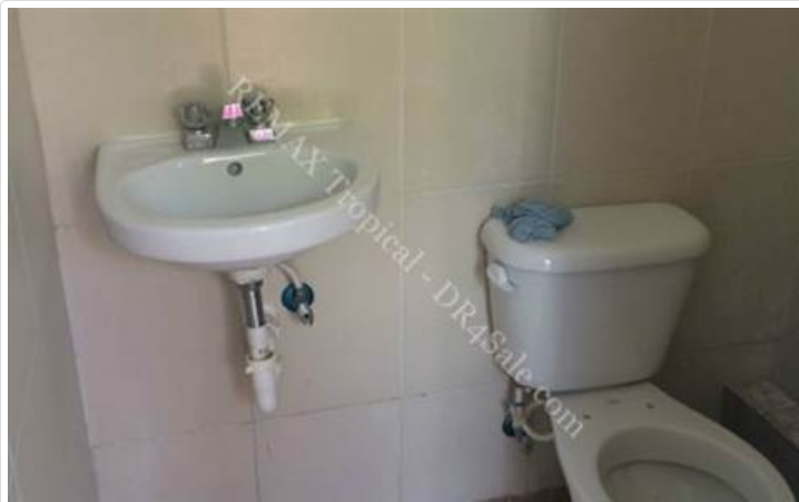
Bathroom in Laundry Room