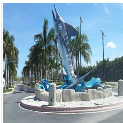
San Juan Plaza