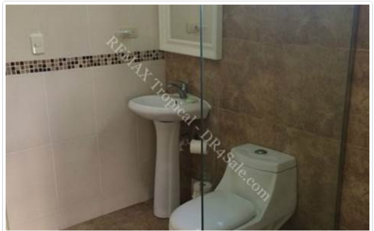
Bathroom no 2