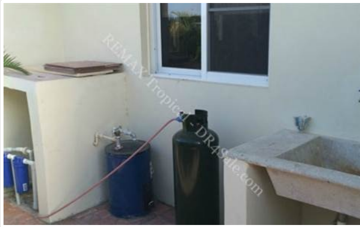
Outdoor Wash Area